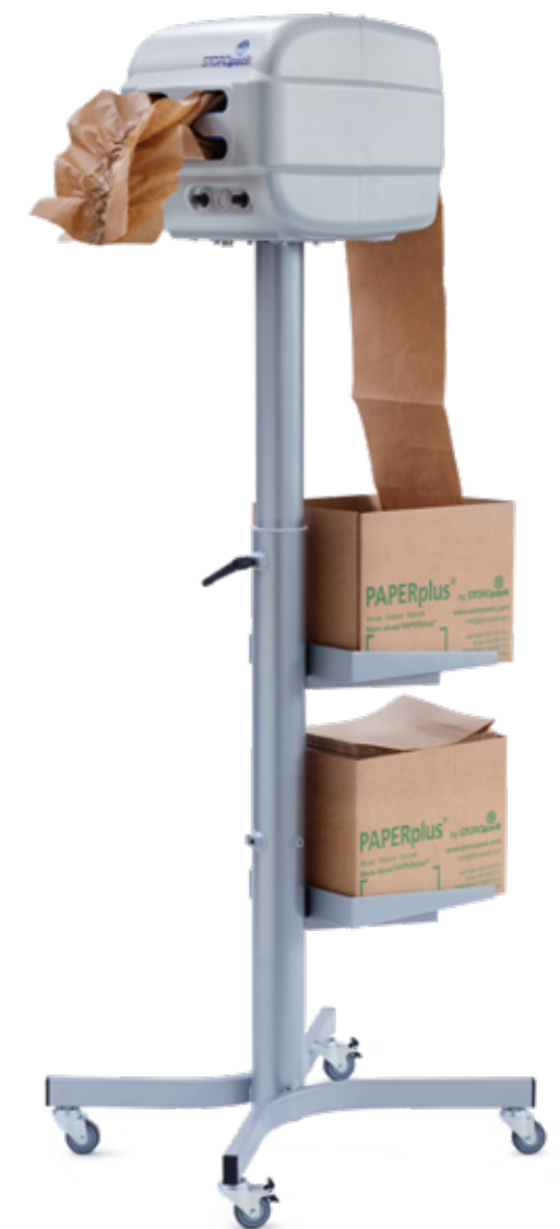
PAPERplus® Papillon Floor Stand Model

▶ PAPERplus® Papillon product video: www.storopack.com/paperplus-papillon-video