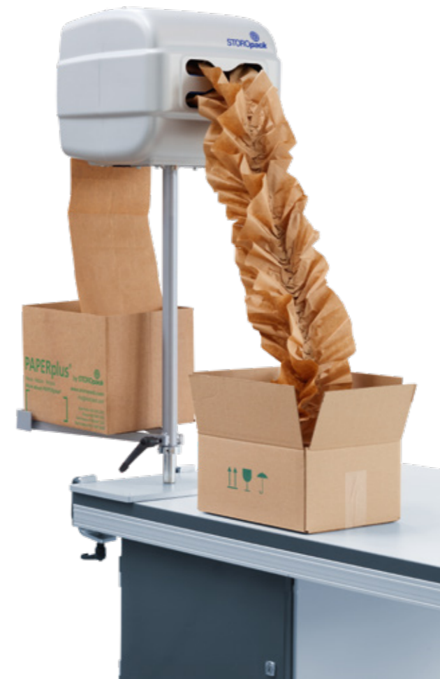
PAPERplus® Papillon Table Stand Model