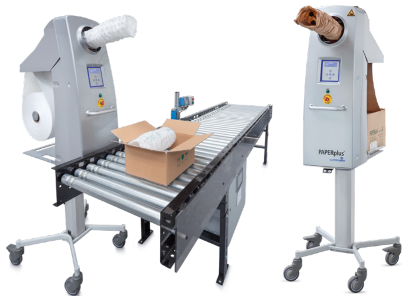
PAPERplus® Chevron 3