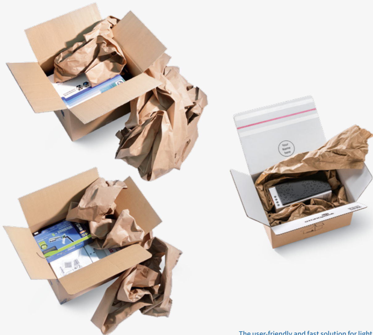
The user-friendly and fast solution for light goods: PAPERplus® Shooter for void fill