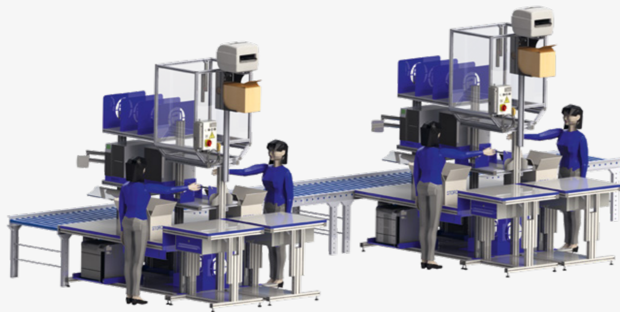
For comfortable and ergonomic work: Working Comfort® solution with PAPERplus® Papillon