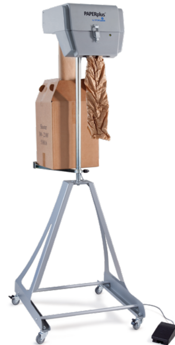
PAPERplus® Shooter Floor Stand Model