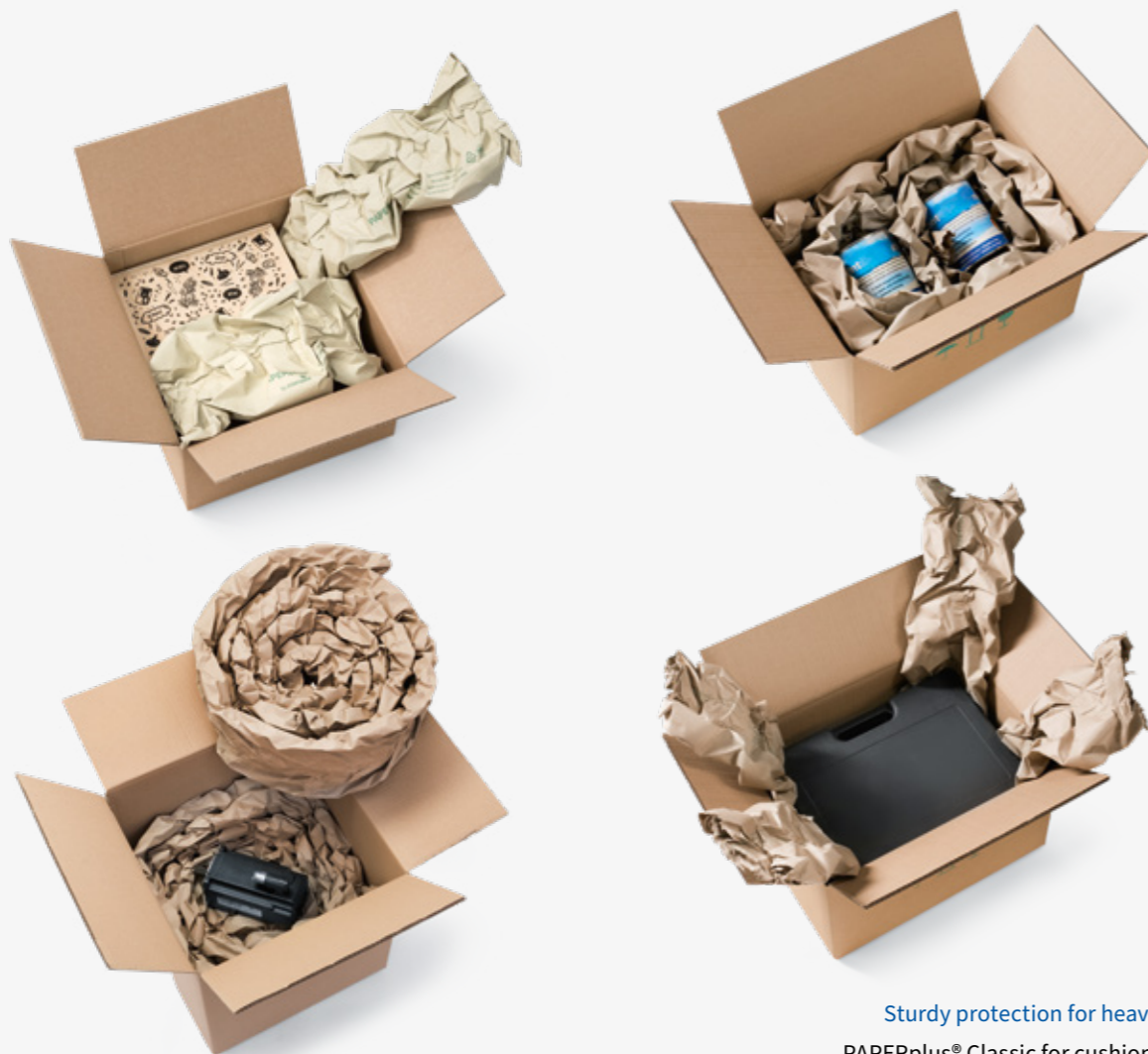
Sturdy protection for heavy items: PAPERplus® Classic for cushioning and block and brace applications