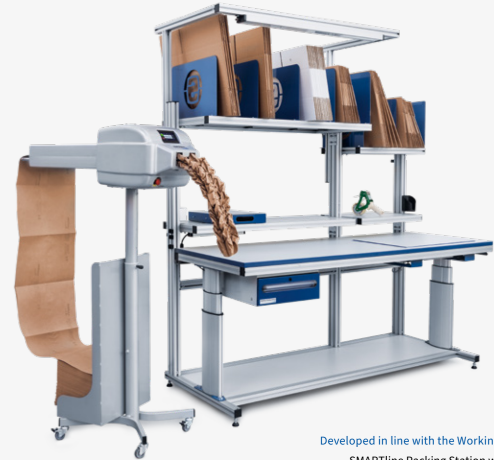
Developed in line with the Working Comfort® principle: SMARTline Packing Station with PAPERplus® Track