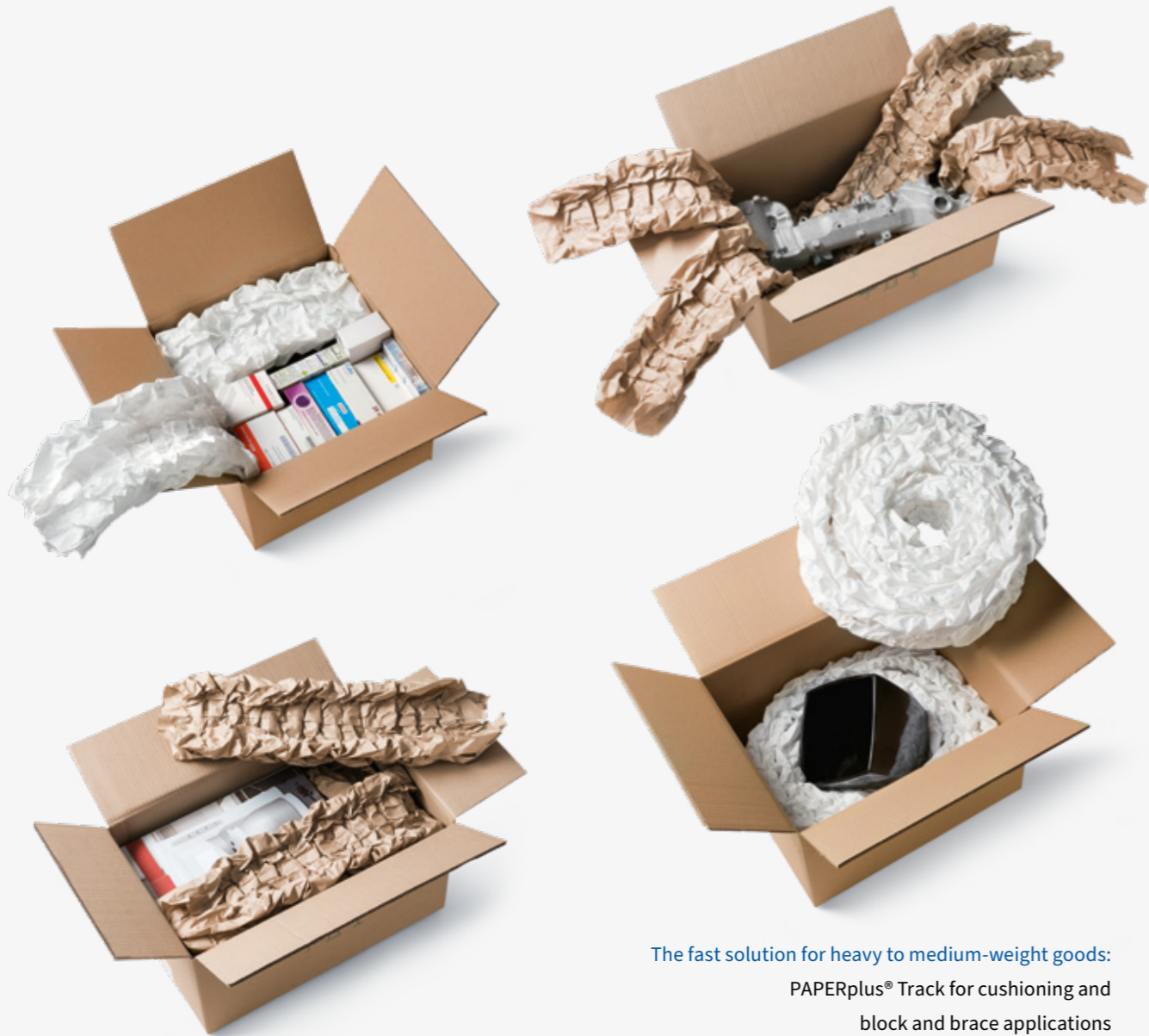
The fast solution for heavy to medium-weight goods: PAPERplus® Track for cushioning and block and brace applications