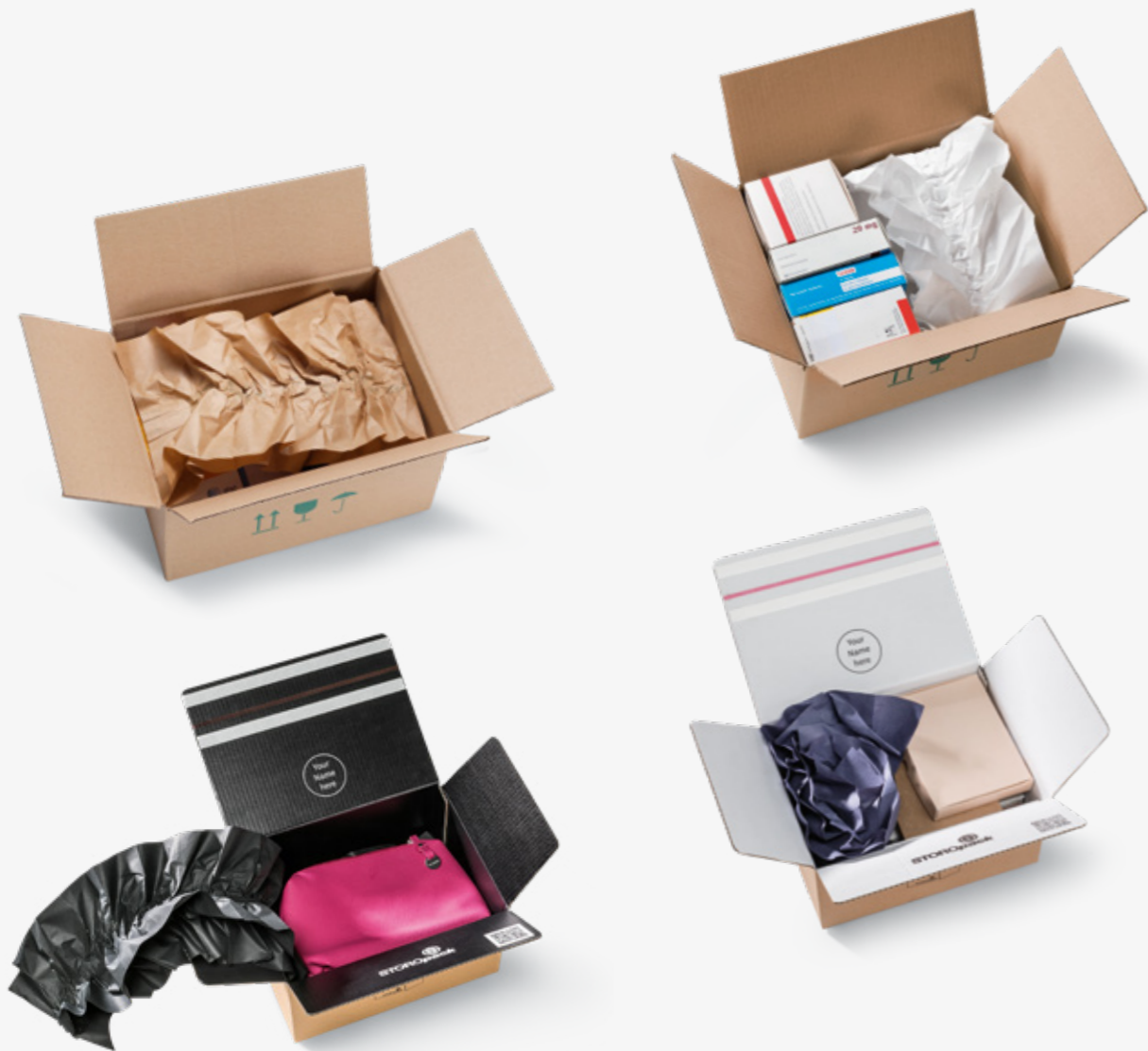
The compact solution for medium-weight to light items: PAPERplus® Papillon for void fill and wrapping